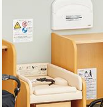
Easy to pull out with one hand